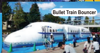
Bullet Train Bouncer